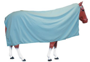
2nd prize: polar fleece cooler in navy blue (style as pictured above)

We encourage everyone to try their luck in this year's raffle!