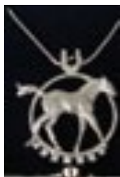
1st prize: sterling silver foal pendant "Clasy Lassie" valued at $225.00 from Poag Jewellers.

Poag Jewellers was established in 1959 and has earned an exceptional reputation from day one. Located in Strathroy, Ontario, they carry one of the larg-